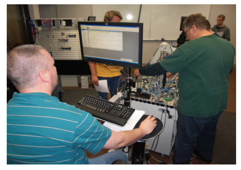
Students program a robotic arm in ECPI's Mechatronics Lab.

"ECPI University is excited to be a part of this effort to help drive the development and training of industry-certified